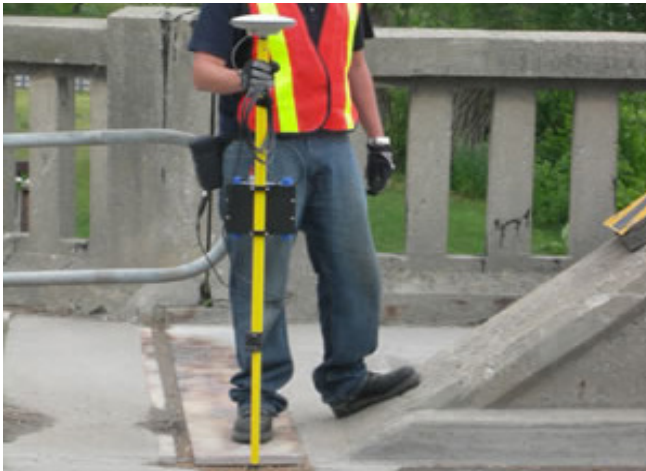
Field operator using GPS to geo-reference located marks

GPR is commonly used in subsurface utility mapping and engineering to provide accurate location and depth of underground assets. Using this information to update maps and identify potential design conflicts saves both time and money in the engineering design process.